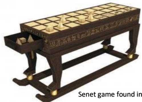
Senet game found in Tutankhamun's tomb