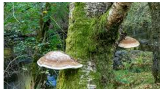
Birch Polypore fungus growing on a tree. This is the same kind of fungus that Otzi was using.

Top tip: Some fungii can be poisonous! Don't eat it unless an expert tells you it is safe!