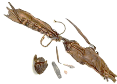
Otzi's leather belt and pouch (after 5000 years in the ice).

Otzi the Iceman lived around 5000 years ago. When he died, his body was preserved in the ice.